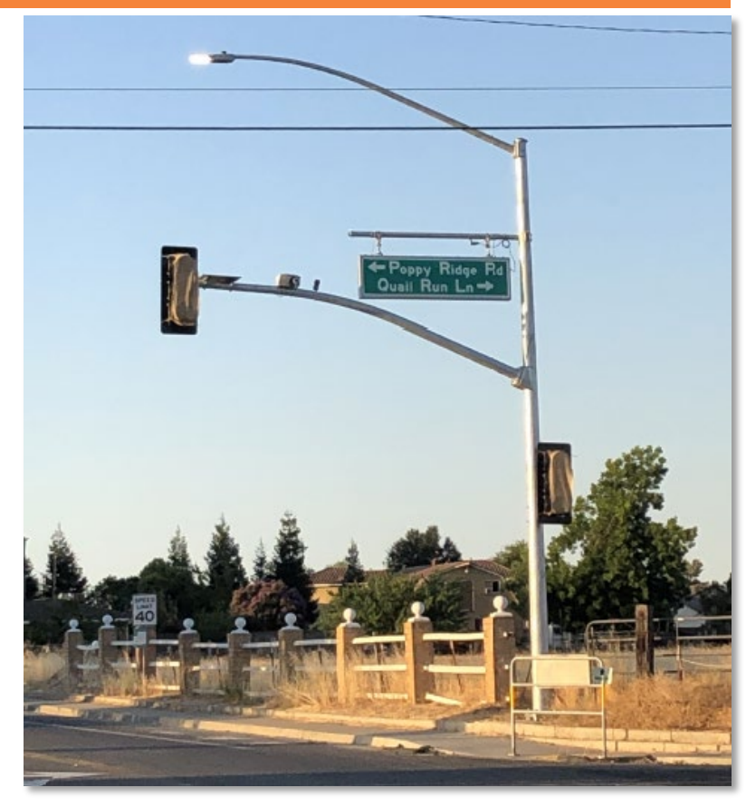
Bruceville Road & Poppy Ridge Road Intersection Signalization