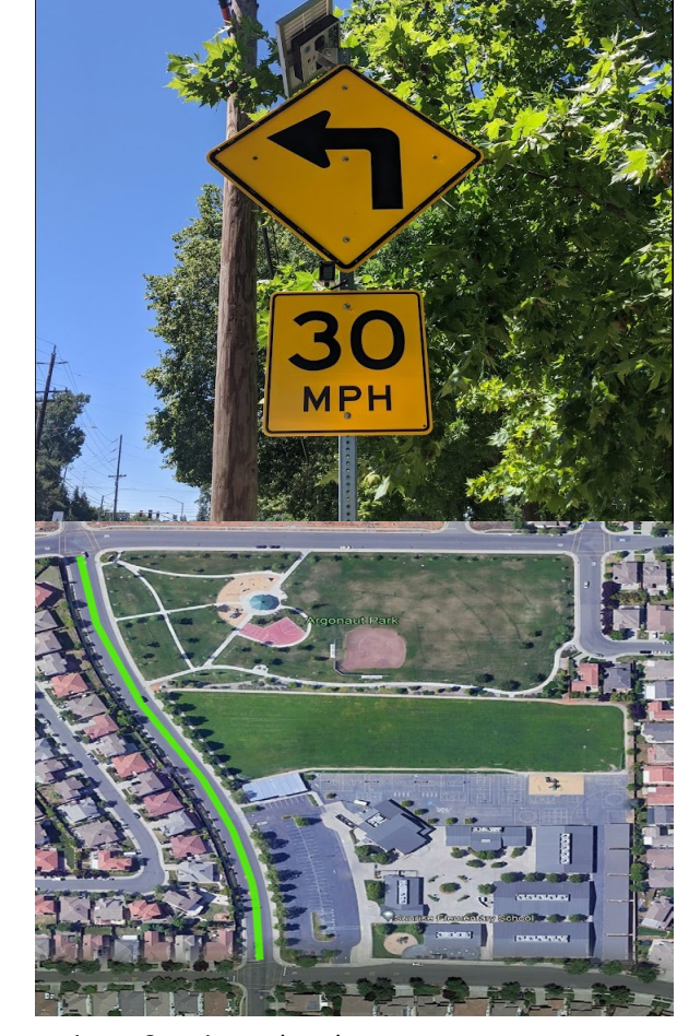
Chase & Coloma (Top) Sunrise Elementary (Bottom)

These projects and programs are vital to improving the traffic safety of the Rancho Cordova community.